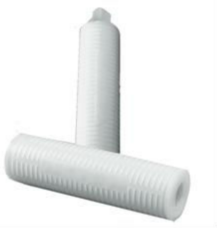
Figure 1: Flotrex HR pleated filters