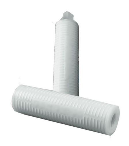
Figure 1: Memtrex HFE filter