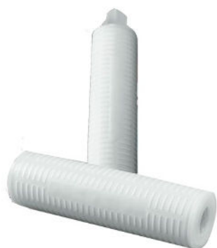
Figure 1: Memtrex PC Filters