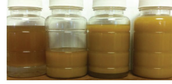
Figure 5: Simple field demulsibility tests can be very insightful in diagnosing the source of clarity problems within an oil sample

In watching NFL football, fans often celebrate the quarterback, running back or wide receiver, believing these stars of the game are the keys to winning. Just as important-and some may say even more important-are the offensive and defensive lines because without basic blocking and tackling, the stars can't do their jobs.