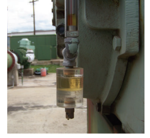
Figure 3: Installed at the lowest point on a wet sump, a BS&W bowl is an excellent way to observe free or emulsified water in oil

A much better option for when the housing does not have a sight glass port at oil level is to use an external level gauge. With a properly installed level gauge, checking the oil level takes a matter of seconds and is much more likely to actually be done regularly. Any liquid level gauge should be marked with level markers, as shown in Figure 2, showing the correct level when the machine is running and when it's down.