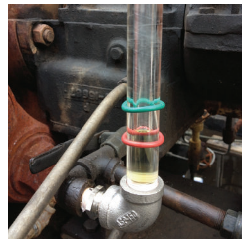
Figure 2: Column level gauges are a great way to quickly and simply check oil level, but any level gauge should be marked with the oil level when the machine is running (red) and shut down (green)

Oil level plugs also tend to be less than effective. In most plants, operators and mechanics simply do not have the time or motivation to remove a plug and check for oil on every piece of equipment. Furthermore, having the machine in operation impacts the accuracy of the level check.