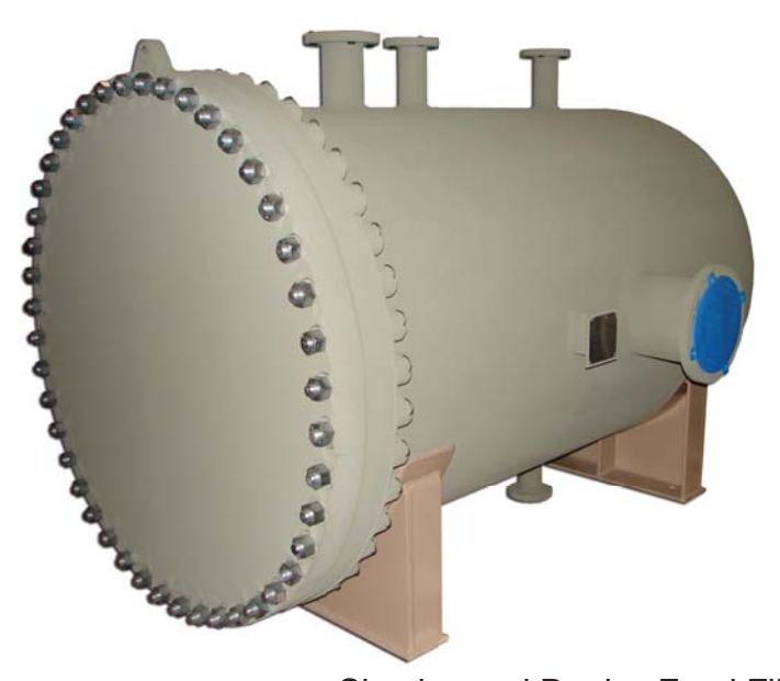
Simplex and Duplex Feed Filtration