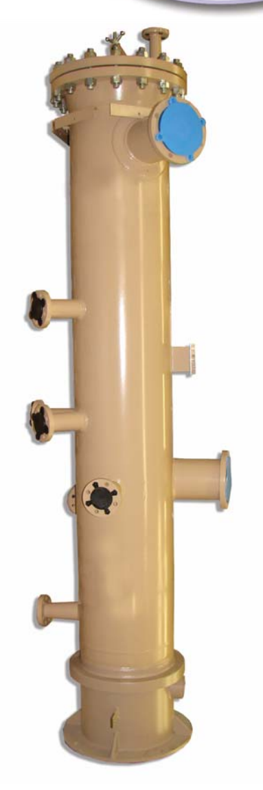
Fuel Gas Coalescer