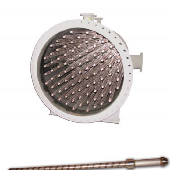
Custom Guide Rod Adaptation

Special Certifications, Domestic Materials, etc.