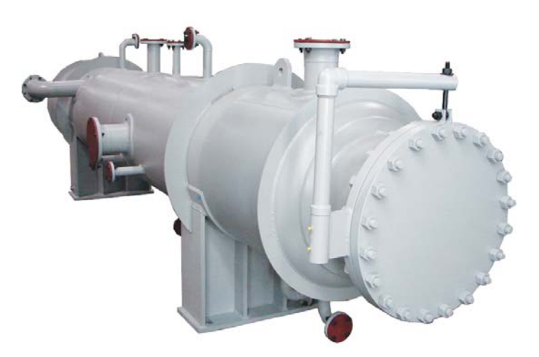
Custom Designed Vessels