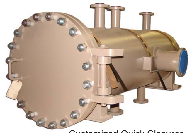
Customized Quick Closures