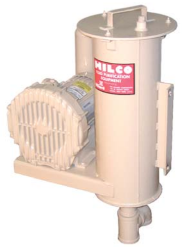
Oil Mist Eliminators