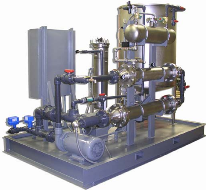
Nominal 7,000 gal/day capacity model shown

The Hilco Ceramic Membrane System is an ideal way to lower your filtration costs. The filtration system utilizes high-velocity “crossflow” across the membrane surface. The advanced-technology ceramic membranes deliver outstanding performance, durability, and cost-effectiveness. The robust filter design and high efficiency can help solve your tough filtration challenges. The filter is well-suited for multiple microfiltration (MF) and ultrafiltration (UF) applications. Available membrane pore sizes are 0.5 \mu\text{m} , 0.2 \mu\text{m} , 0.01 \mu\text{m} , and 0.005 \mu\text{m} .