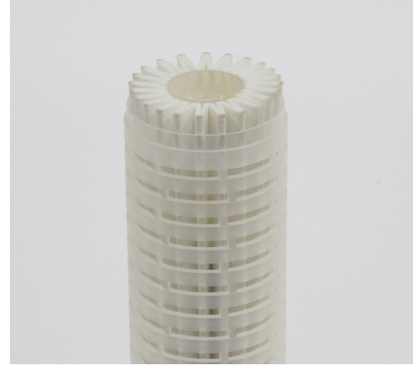
Rigid High Capacity Pleats

This chart represents typical water flow per 10" cartridge length. The test fluid is water at ambient temperature. Extrapolation for multiple elements tends to be linear, but as flows increase the \Delta of the housing becomes more apparent